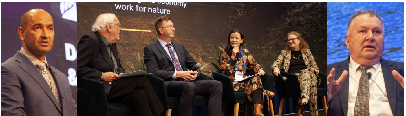
Left to Right: Hon Tama Potaka, Minister of Conservation; Political Panel; Hon Shane Jones, Minister of Oceans and Fisheries