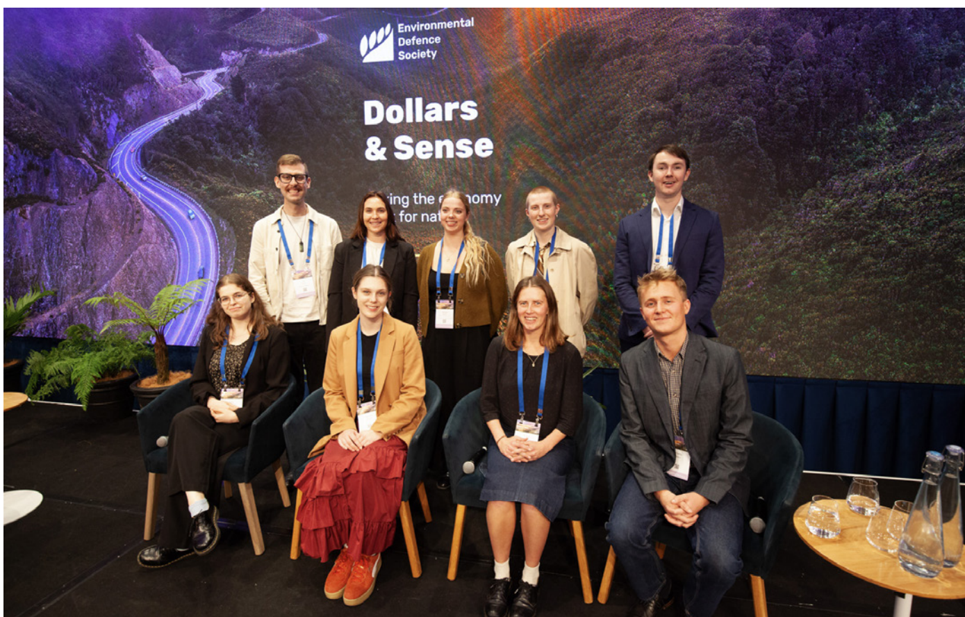
2025 University essay competition winner and Next Generation scholarship attendees